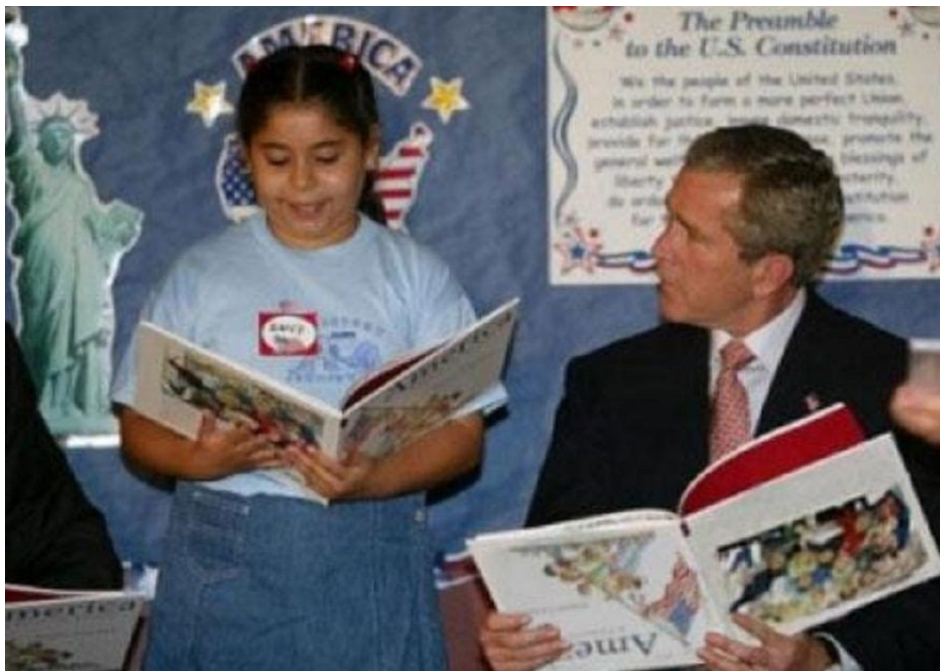
Manipulated image of George W. Bush in a school in Houston in 2002

Even images that have been altered for the purposes of satire cannot always be identified as such by recipients. A picture taken in a Texas school in 2002 showing former US President George W. Bush holding a book upside down was used to lampoon Bush long after the event. This kind of image manipulation is a minor intervention that has a major effect: it distorts the patriotic staging of the image and the message it conveys, while at the same time mocking Bush.[3]