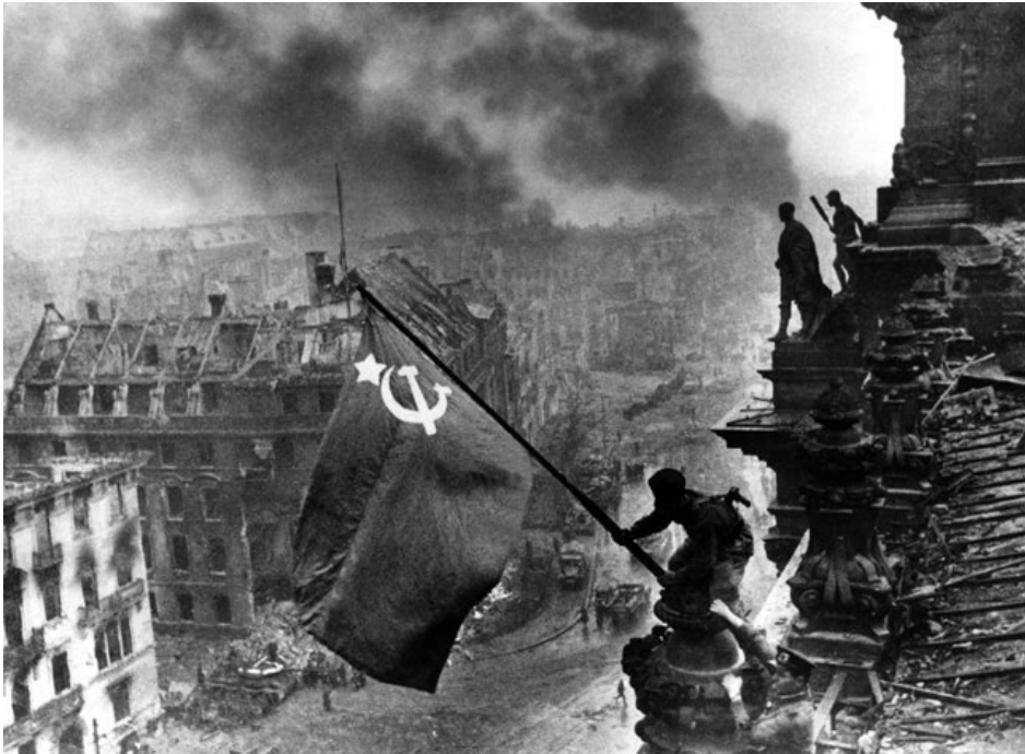
Yevgeny Khaldei, Hoisting of the Soviet flag above the Reichstag, Berlin 2 May 1945 (edited version)

Even images that have been altered for the purposes of satire cannot always be identified as such by recipients. A picture taken in a Texas school in 2002 showing former US President George W. Bush holding a book upside down was used to lampoon Bush long after the event. This kind of image manipulation is a minor intervention that has a major effect: it distorts the patriotic staging of the image and the message it conveys, while at the same time mocking Bush.[3]