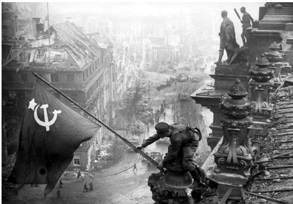
Yevgeny Khaldei, Hoisting of the Soviet flag above the Reichstag, Berlin 2 May 1945 © Sammlung Ernst Volland/Heinz Krimmer/Jewgeni Chaldej; source: https://blogs.taz.de/vollandsblog/2008/07/23/die_flagge_auf_dem_reichstag_teil_3_das_manipulierte_foto/

It is important to point up the historical context of fakes and modern propaganda. After all, distorted facts, conspiracy narratives and lies have played a major role in history. Photographs were used as early as the nineteenth century to give an impression of a reality that did not exist in that form.[1] One notable example is the iconic photo of the Soviet flag on the roof of the Reichstag after it was captured in 1945. When the building was actually stormed, there were no photographers there. The picture taken by Yevgeny Khaldei is not an original in two respects: it was taken more than a day later, on Stalin's orders, and it was subsequently edited. The smoke clouds were added in and the watch on the soldier's wrist – which may have been stolen – was retouched out by the photographer.[2] The Nazis had murdered several members of Khaldei's family and he saw himself as a propagandist in a good cause.