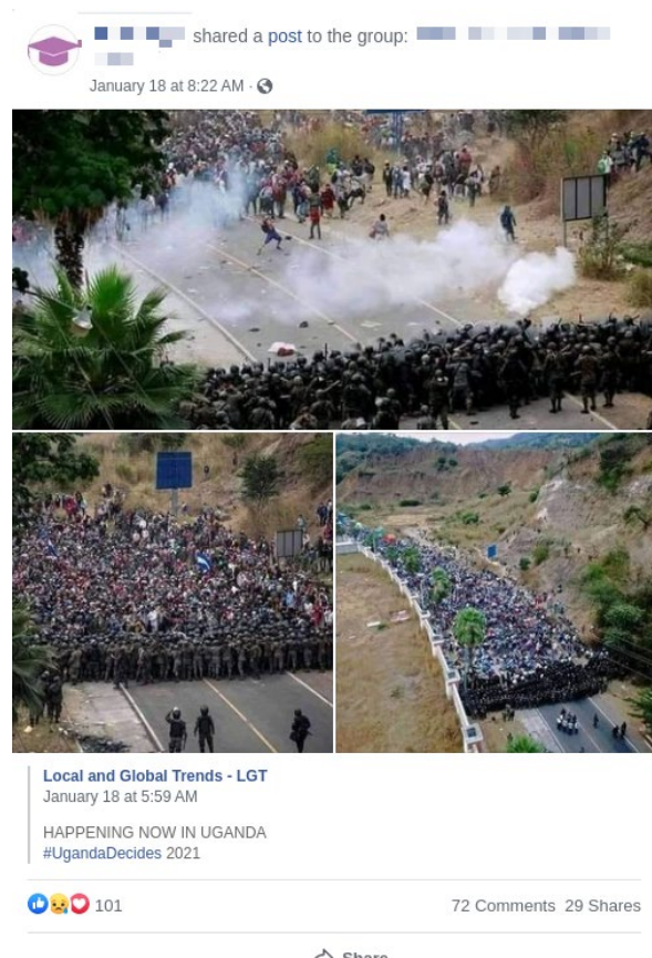
Photos from the Guatemalan border, used here in a Facebook Group in a falsified context to represent Uganda; names anonymised by the author; original: Agencia EFE

It is clearly important for us to recognise the dangers posed by deepfakes and anticipate the impact they might have in future. But the fact is that many of today’s visual fakes are not actually created with image-editing programs and there is a spectrum ranging from deep-fakes to cheap fakes along which all such manipulations can be found. This is because it’s much simpler just to take a real picture or video, strip away the context and circulate it together with a made-up story. Cheap fake techniques have been very effective thus far and, unlike the deepfake, can be implemented with minimal resources. They were used in 2020, for example, to spread fake news about the coronavirus pandemic.[7] This is a widespread phenomenon: witness the photos that did the rounds after the election in Uganda in January 2021. The pictures, as posted by Facebook users, had been taken out of context and supposedly showed rioting in Uganda. However, they were actually pictures of people from Honduras trying to cross the border into Guatemala.[8]