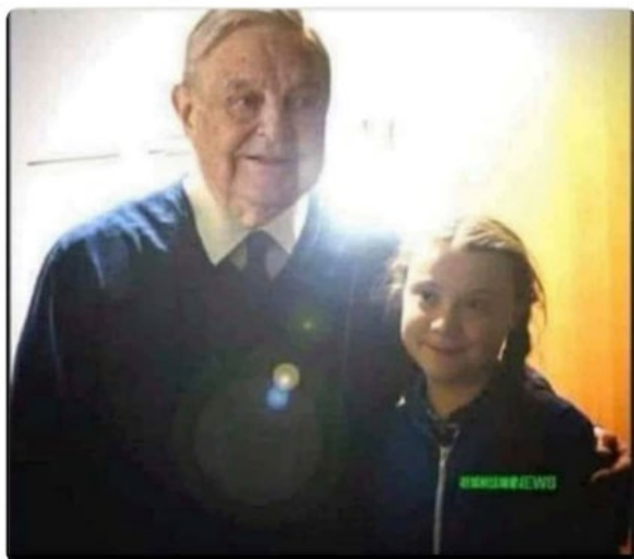
Manipulated photo supposedly showing Greta Thunberg and George Soros

This is that climate change girl Greta with George Soros. As soon as I saw the pic I noticed there is a very strong resemblance. I feel he is behind all these climate change marches for his Globalist agenda